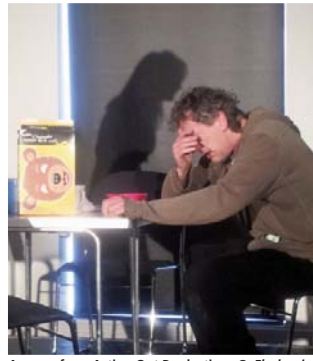
A scene from Acting Out Productions

community and military settings respectively. A range of evidence-based approaches were piloted in an area of high mental health need and were tailored to community, employer and college settings: ■ Short bespoke plays and forum theatre ■ Mental Health Ambassador scheme (providing meaningful 'social contact' opportunities with the public) ■ Mental health awareness educational sessions - with input from ambassadors. Pre- and post-intervention questionnaires included validated knowledge and attitude measures used by the Time to Change campaign. Results showed statistically significant improvements in participants' knowledge, attitudes and confidence in